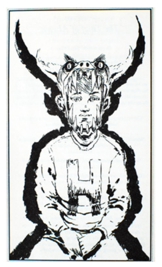
Fig. 3 This image appears on the third page of the book, prior to any numbering.

of Harvey, presented even before the title page for the book; it is one of clear division and duality within the child: