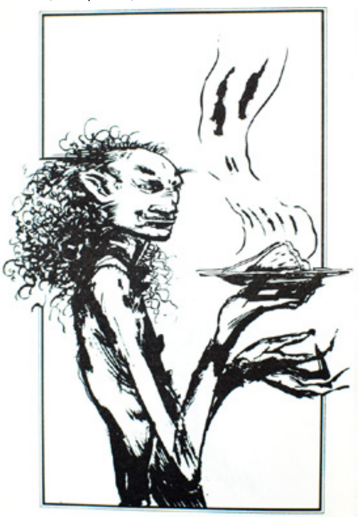
Fig. 2 Jive holding the illusion of pie ( Thief 158).

Harvey returns to the House. His newly-acquired defense against the mirages of the House is foregrounded in an encounter between him and a tempting slice of pie offered as a distraction meant to lull him back into the rhythms of the house. However, the false-image fails and Harvey, armed with his new ability to see truth, recognizes the façade as the pile of dust that is its true nature: "He looked back at the pie, and for a moment it seemed he glimpsed the truth of the thing: the gray dust and ashes from which this illusion was made" ( Thief 161).