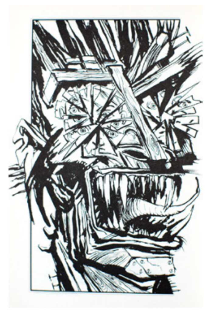
Fig. 11 Hood as a man (Thief 206).

returns, rising from the rubble to take the form of a man.