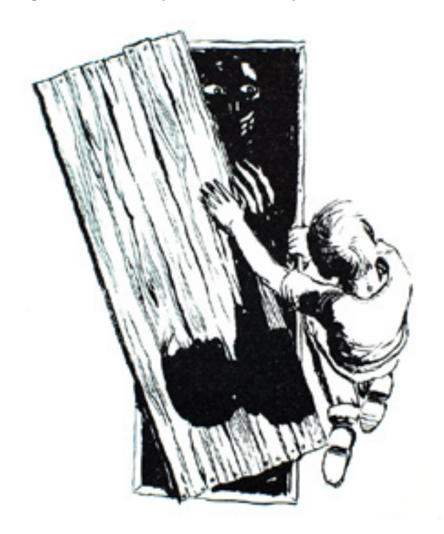
Fig. 6 Harvey as duality, white and

black, body and shadow, saviour and witness of death ( Thief 142).