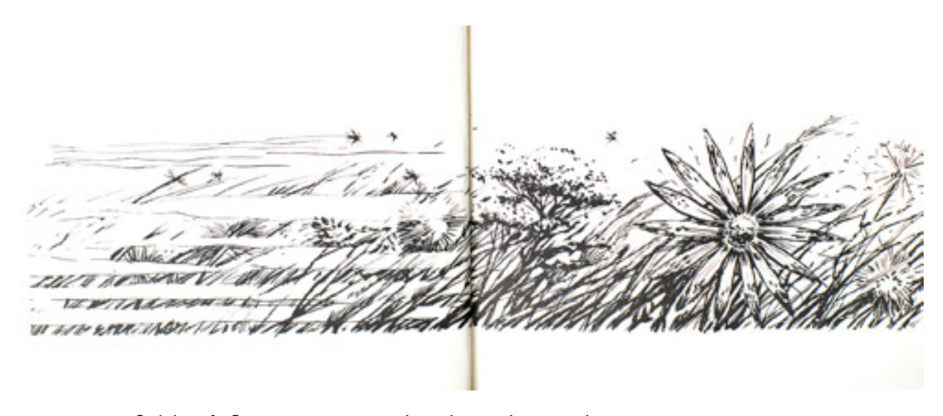
Fig. 9 A field of flowers materialized across the two final pages of the chapter ( Thief 16-7).

The text that accompanies his crossing the border between reality and fantasy points to the first of many sexual subtexts that charge Harvey's visit to the Holiday House with the threatening presence of a child predator. As Harvey approaches the fog, "within three steps of the wall a gust of balmy, flowerscented wind slipped between the shimmering stones and kissed his cheek" (Thief 16; emphasis added). The use of "slipped between," most commonly followed by the sheets, amplifies the sexual suggestion of Harvey's kissed cheek, but this kiss is perceived—if it is acknowledged at all—as innocent because its source is magical and the knowledge that supports it is childlike. Because children's literature positions the implied reader in a state of childlike innocence, the sexual subtext of the wind's kisses, made more disturbing in the knowledge that Hood controls everything in the fantasy realm, wind included, can easily remain concealed within the text.