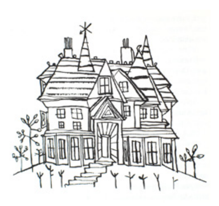
Fig. 1 Harvey's drawing of the Holiday House ( Thief 130).8

more through the act of drawing, Barker is able to convey more through his illustrations. Conversely, this reliance on illustrations also reveals a lingering distrust in language's ability to describe traumatic experiences.