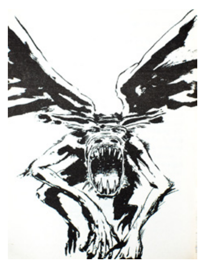
Fig. 7 Carna with mouth agape, ready to receive ( Thief 108).

( Thief 111, 87-8). Thus, it is the denial of fantasy that dissolves the monster.