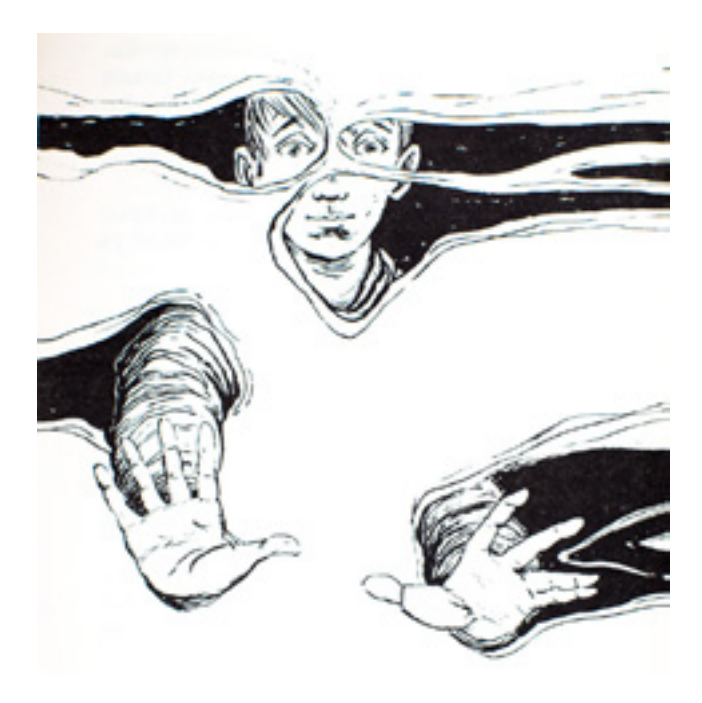
Fig. 8 Harvey travels through the wall of fog ( Thief 10).

Magic obstructs this truth, making it unbelievable, even within the narrative. The predator's hide-away is a magical house hidden behind a mystic shroud of fog, a wall whose "misty stones seemed to reach for him [Harvey] in their turn, wrapping their soft, gray arms around his shoulders and ushering him through" (Thief 16). This romanticized, fantastical image of a child being welcomed into a magical realm, when seen through the suspicious eyes of an adult gaze, is a threatening image of a child willingly accompanying his abductor to an unpleasant fate. The illustration of Harvey passing through the wall serves this same purpose. No monstrous arms reach to grab Harvey and pull him through, but rather the fog dissolves into a yielding wall of mist that easily allows for Harvey's passage to the other side where a field of flowers awaits.