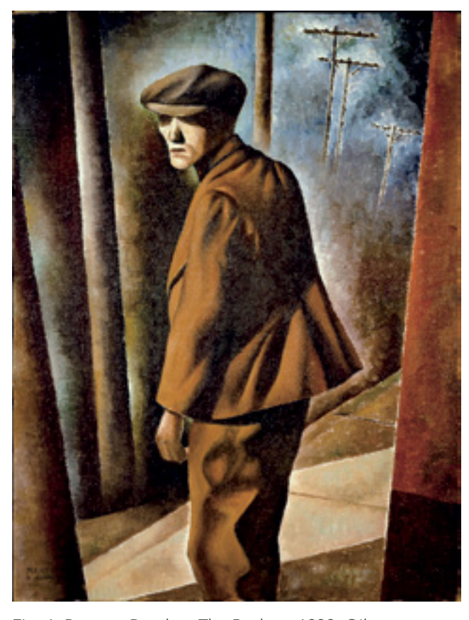
Fig. 6. Bertram Brooker, The Recluse , 1939. Oil on canvas, 61 x 45.7 cm. The Montreal Museum of Fine Arts, Gift of Walter Klinkhoff, 1978.3.

Brooker's questioning of the modernist ideology of progress is even more overt in his 1939 painting The Recluse (Fig. 6), in which the defiant gaze of a vagabond confronts the viewer. The drab clothing of the gaunt figure contrasts sharply with the iconography of progress and electric palette of the background: a receding line of telephone poles, whose cruciform outlines conjure the salvational drama of Golgotha, that seems to represent all the benefits of modernity that have been denied the social outcast. It is significant that Brooker has chosen telephone wires-symbols of the same nexus of empire and communications of which his own work in advertising was an increasingly integral component in Canada—to visualize the limits of modernity, thereby implicating this late painting within the same discourse on advertising, modernity, and time as the artist's lesser-known, but no less poignant, illustrations for The Canadian Forum.