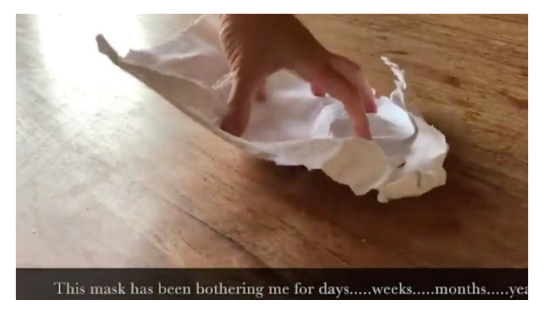
Figure 2: Still from "Braiding Dislocated Lives" (Frølunde et al; 2020, 2:25 mins).