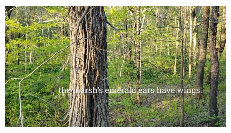
Figure 3: Still from "Marsh Wings Faded" (Dunlop, Wolf, Hutchinson, and DeGarmo, 2020 1:07 mins)

2020), moved from hectic 1950s black and white commercial footage of white people consuming media to contemplative colour video clips of a lush green forest. Similarly, "Out, Empty, Away" (Seddighi, Murray, Dorsey, and Sarwatay, 2020) pulled on a narrative thread that led from close-up images of micro spaces inside the home to a subtle exhortation to become involved in protests to support Black Lives Matter, and to a critique of white supremacy in the details of the stereotypical, seemingly safe middle-class home. The final short video in this sequence, "Ice melting on artwork" (Cooper, 2020), acted as an interstice between these two videos and the next set of videos, comprised of a moment-in-time-lapse without sound, and completely without resolution.