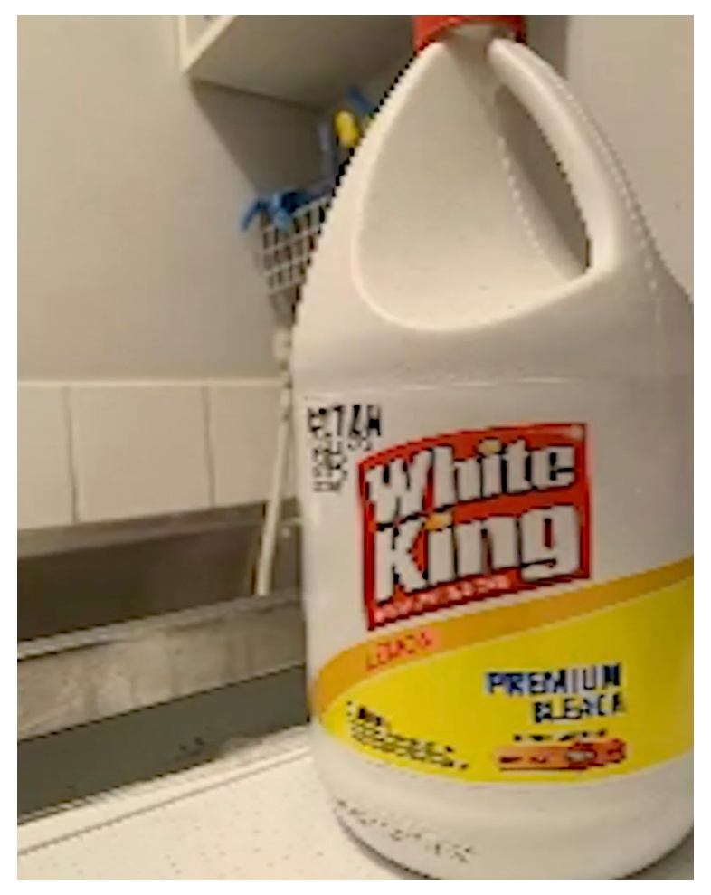
Figure 4: Still from "Out, Empty, Away" (Seddighi, Murray, Dorsey, and Sarwatay, 2020, 3:29 mins).

liciously lush green forest, accompanied by a quiet piano sonata, "On a Summer's Day".