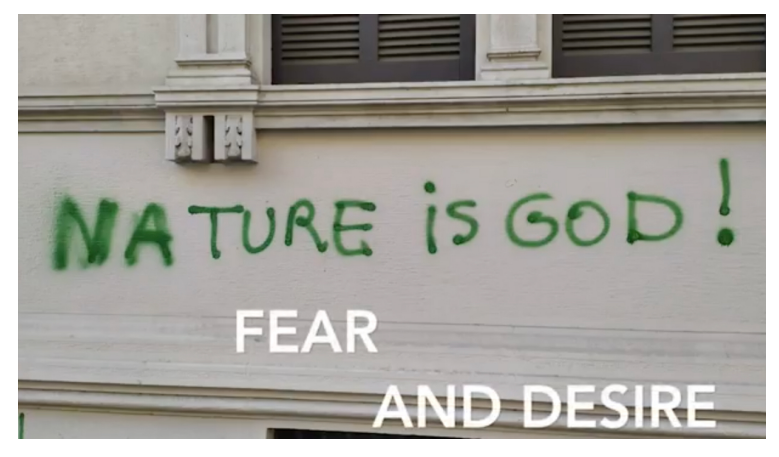
Figure 8: Still from "Birdsong" (Snepvangers, Murray, Pronzato, and Waysdorf, 2020,

The video is a visual essay that incorporates many still images, including drawings and photographs, with a series of fragments of dense quotations and excerpted comments in text in English from May and June 2020 threaded among the stills. The text (more than the images) raise questions about the relationship of human to more-than-human, about the (macro) threats posed by the virus, by protests, by contested politics, and the (micro) comforts from a privileged position of researcher.