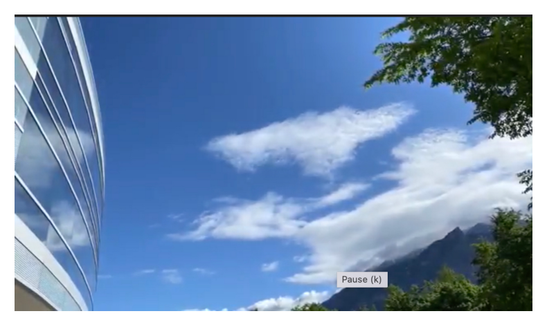
Figure 5: Still from "The Warrior" (Torres, Peterken, Jones, and Chen, 2020, 0:51 mins).

consumerism, time to write, etc.), or recovery strategies to be developed to ameliorate damage that was done during this time, or to what degree participation in social justice protests and efforts to change nation-state regulations, legislation, and budget processes could affect policing practices, policy development, and funding.