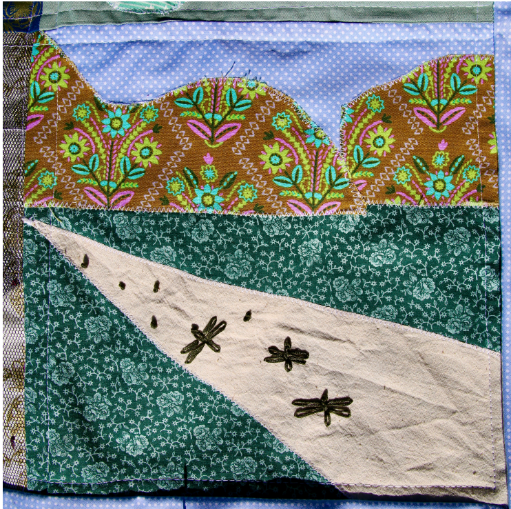
Figure 11: Dragonflies dancing.