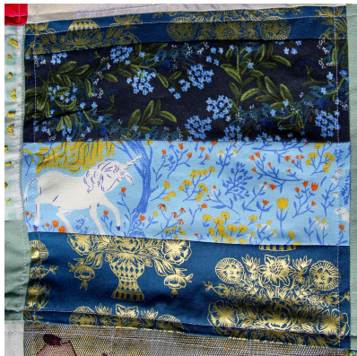
Figure 8: Blue.

This Blue (Figure 8) quilt block was made in relation with the walking and images for a collaborative MMS video (Frølund et al.) that braided the dislocation of researcher lives and selves with the pandemic, noticing the stillness and messiness of that. I noticed blue for hope, loneliness, blue breath, and blue skies as not only fair weather in images I made for the video. As we wove our experiences across the world into the imagery we were “reading insights through one another” (Barad, “Meeting the Universe” 25) to notice what was happening at that moment. Being with images and others as researcher/teachers who embody the “caring diligence required” (Markham et al. 6) for learning gave openings for connections and more perspectives that were hopeful. Blue (Figure 8) is central in the quilt, so it touches all the blocks as COVID touched all our lives. The magical presence of a unicorn and gold patterns in it also offered glimmers of hope when all I noticed was blue. Working with others across time zones in the MMS research held some challenges but was enriching as we threaded our lives, stories, and the world, sensemaking together in the video. That mattered to us.