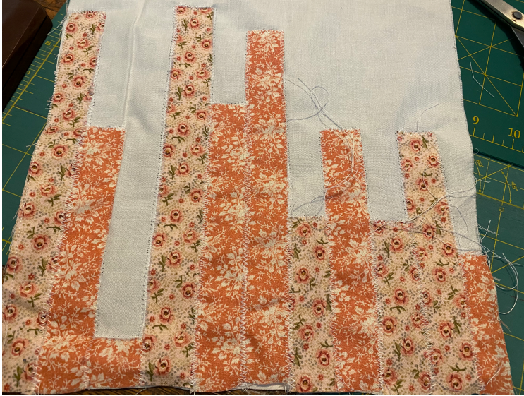
Figure 14: Walking, iPhone steps graph.