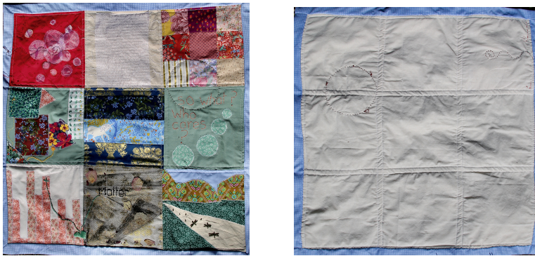
Figure 1: Finished quilt front and back. Image of quilt provided by author.