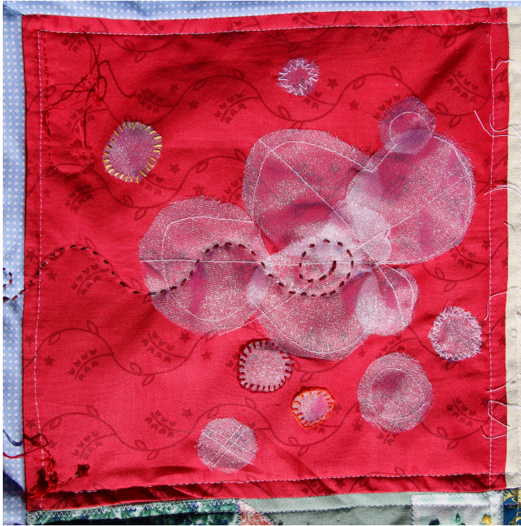
Figure 4: Pandemic bubbles.

Wandering by myself and staying in to remain in my pandemic bubble shifted with the MMS prompts to wondering and making sense with art materials stashed in two nine-cube shelves and in baskets in my home. I sewed from four years of age, making clothing for dolls, and made clothing for myself and others from my mid-teens. I have supplies on hand to quilt, sew, knit, crochet, embroider, weave, spin, paint, and bead, as well as natural materials such as feathers, sticks, stones, grasses, and seed pods found and gathered from my yard and as I walk around my neighborhood for collage and adding to art pro-