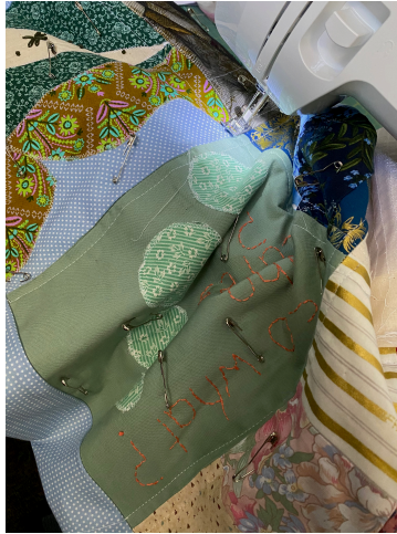
Figure 9: Sewing, quilting through. Image provided by author.