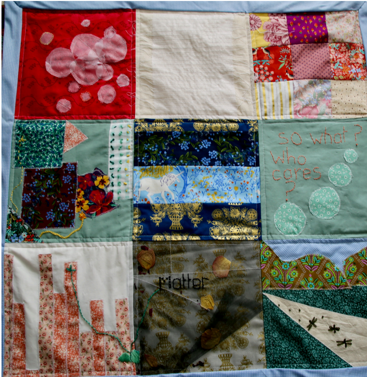
Figure 2: Completed quilt.

The nine blocks connect across the whole quilt (Figure 2), and each of the blocks holds individual and collective sensemaking. Some responses in the quilt blocks were from an individual MMS prompt, such as in Green dot (Figure 3) seen in the still image from a video of Rock Canyon that is in relation with the idea of technology making its presence known, impacting what is seen and experienced.