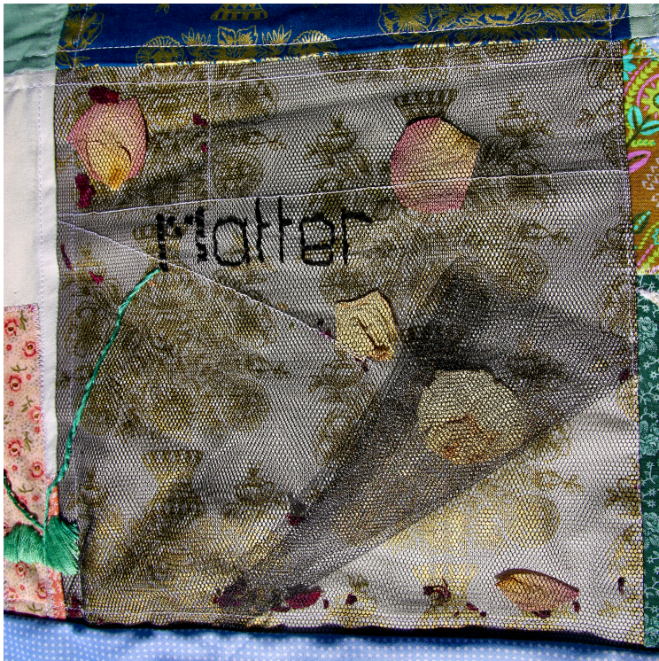
Figure 12: Matter.

I attended community gatherings in support of Black Lives Matter while inquiring with the MMS prompts. Making the Matter quilt