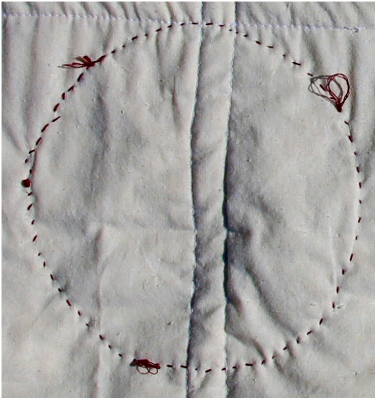
Figure 13: Tangles make sense.