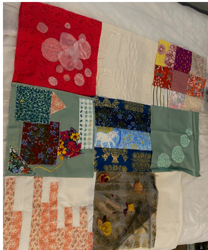
Figure 15. Pieced blocks laid out. Image provided by author.

I return visually with this image (Figure 15) to laying out the blocks to assemble the quilt with all the various combinations that could