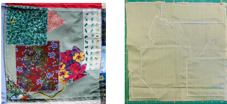
Figure 10: Mapping pandemic home.

Handmade blocks for a quilt as part of storytelling (Ingold “Making”) provided room to learn and presented “guidance without specification” (109). Openings between things that matter as held in each block were joined together as the quilt was pieced, sewn, pinned through, and quilted (Figure 9). This process provided a means to attend to matter for making sense. The quilt blocks, the quilt as a whole, and materials are telling with color, texture, juxtaposition, stitches, repetition, and rupture.