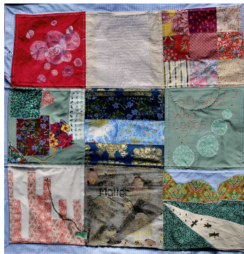
Figure 16: Quilting connecting lines.