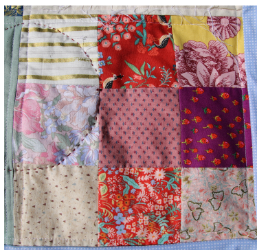
Figure 7: Flower squares.

I was also stitching a tapestry. The stitches were made in the same way seeds are planted, “thread[ing] through and among” (Ingold, “Making” 132), laying lines, line by line in rows, or here and there, entangled. The Flower squares (Figure 7) block of the quilt holds this sensemaking and the way that meaning (like flowers where I walk, and in my garden) can be laid out in tiny increments before me, before us.