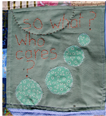
Figure 3: Green dot.