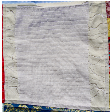
Figure 5: Blank journal.

As I moved around my neighborhood, I noticed small elements and connections with larger contexts. I gathered images of moments that captivated and matter that evoked awe. Moments of making with the quilt then gave extended time for attention to feelings and to make a difference to my knowing in the making (Ellsworth). This brought me hope and some comfort along with my concern for others and the planet. Pandemic time lengthened and collapsed (Ingold “Making”), and with no attention to markings on a clock, days melted together into a week, or it could have been a month? “How long will this go on?” I wondered ... “when will bubbles pop?” Time and space also collapsed as I spoke with friends and family (me in my time) across multiple continents and time zones, in my home, in my town and state, and others all over the world. We were in virtual bubbles. Connections online and offline helped us in knowing self, others, and the world. Lines of communication, walking lines, and lines of sewing converged in the quilt. One block, Blank journal (Figure 5), became a piece of crystal organza sewn through with lines. Lines with messy ends. Gaps that still sparkle and draw attention. They present unseen events and encounters, more that I can and cannot do for others and the world, if I learn and attend and act.