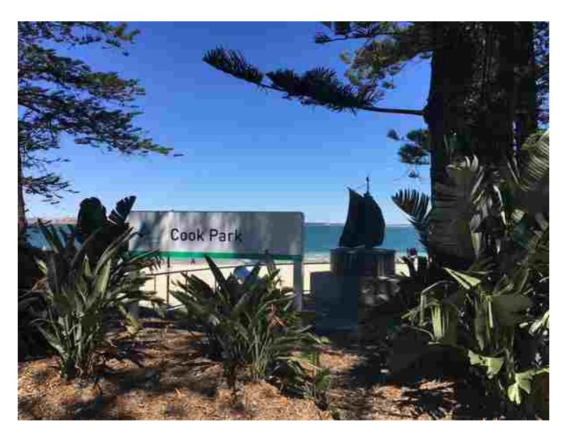
Figure 3: Looking towards the Heads of Botany Bay (Kamay) from Cook Park, Bayside Council, Sans Souci, 2020.

journalist Stan Grant, a Wiradjuri man, argued for historical accuracy. He contested the inscription on the statue, which states that Australia was discovered by Cook in 1770, a description that for him aligns with the national narrative of Australia's discovery by the British, and omits recognition of the country's Indigenous inhabitants . Intense debate followed this article, with some politicians sounding the alarm over the rewriting of history. Meanwhile, this example highlights how national imagery in Australia is undergoing a phase of contestation and enquiry about the meaning and connectedness of national narratives (Giovanangeli and Snepvangers 2016).