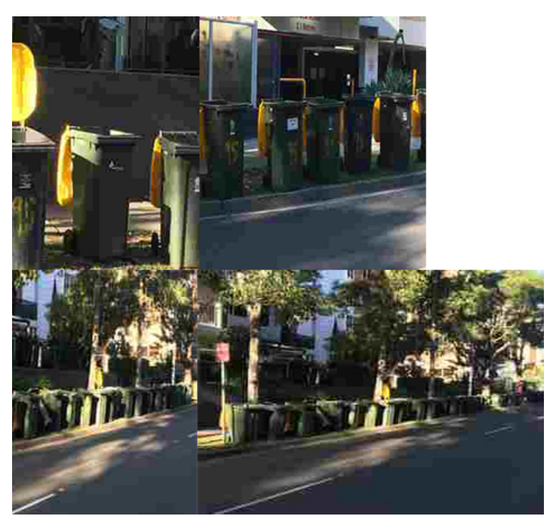
Figure 5: Filmic Cuts of Recycling Bins from Number 95, Streetscape in Kamay – (Botany Bay), 2020.

challenge to seriality as sameness, limiting the actions of individual bins, for example, as they are not generic and have social constructs that open the possibility of resistance and non-compliance. These are some of my initial thoughts on the sustainability of bin collection at the system-level, especially about the possibility of garbage recovery and what this might mean. Yet, I am grounded in the thought that these are garbage bins with little or no street appeal. Secondary to the bin itself is the logo, with its historical binaries and Captain Cook, so I am placing hope in questioning and even contradicting the original usage and intention of each object in this article.