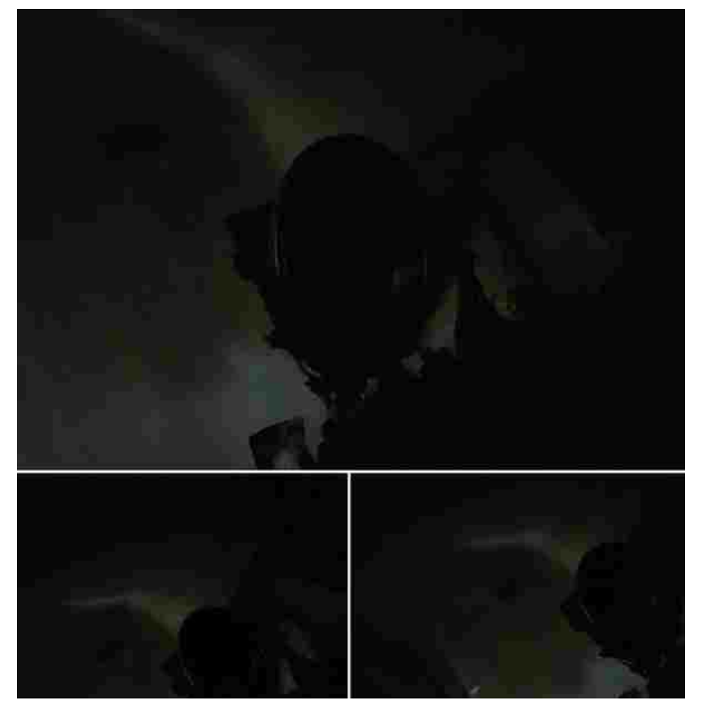
Figure 1: The Mirror in My Room, 2020.

Anzaldúa's Coatlicue state of using the mirror and the morning shadows, light, and seeing through an experience is taken up quite literally in my work in Figure 1. The addition of shadows to mirror work