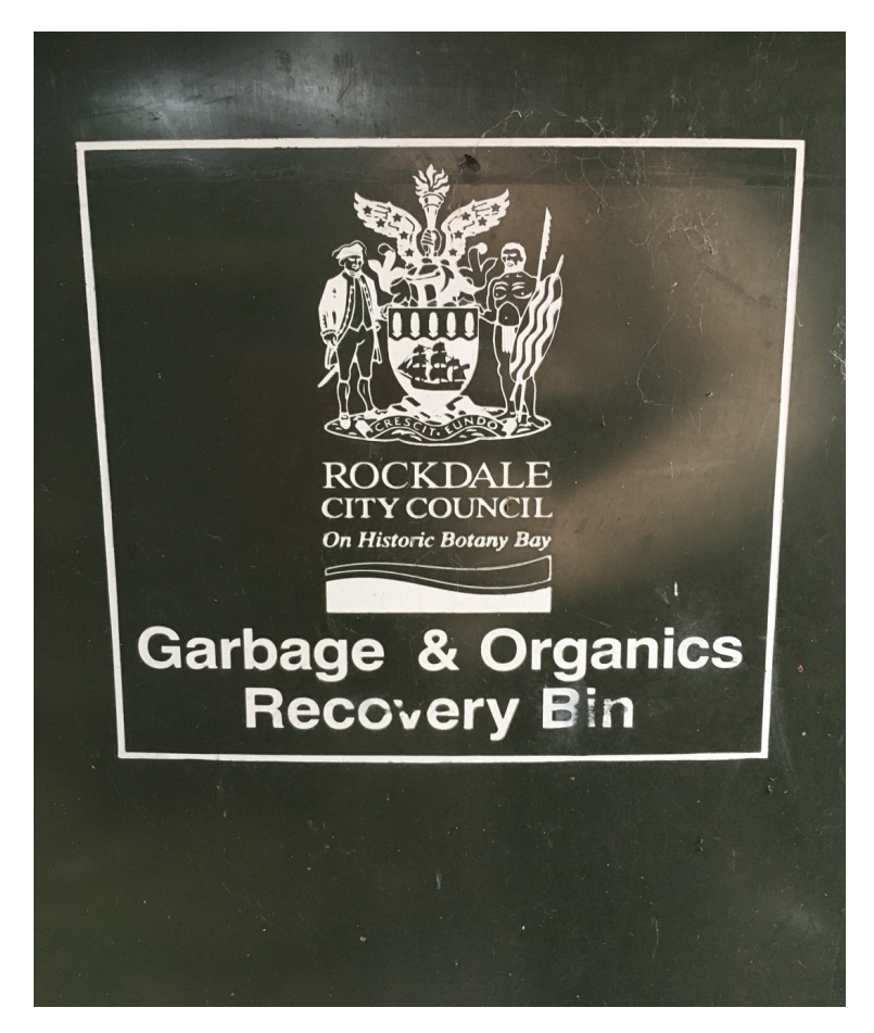
Figure 2: Image of Self in the Recovery Bin Logo from Kamay - (Botany Bay), 2020.