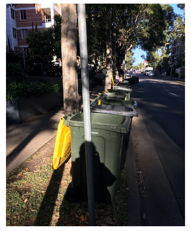
Figure 4: Image of Self in Row of Recycling Bins from Kamay – (Botany Bay), 2020.

ened my observations of daily procedures and historical tensions, especially stemming from the initial focus on my own garbage and recovery bin in my front yard. This grew to a communal interest. This is because the logo on my bin is repeated all over the suburb, and indeed the whole council area, thus reinforcing historical events from