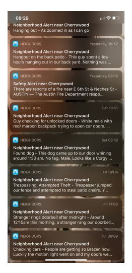
Figure 6: Screenshot of notifications from July 17<sup>th</sup>-July 19<sup>th</sup>, 2020. Screenshot recorded on July 20, 2020.

of 2020, I would walk through my neighbourhood every morning on my way to campus. Even if I did not meet any people that I knew, I still passed by the same coffeeshops, bus stops, and buildings, seeing if anything had changed since I had walked home the previous evening. By contrast, the only times I would regularly leave my apartment during the heart of the pandemic were to go grocery shopping once a week, or for rare social gatherings that were carefully planned to follow public health guidelines. The face-to-face interactions that had happened frequently with my friends, neighbours, and strangers were replaced with observations made by users on platforms like Neighbors, moving my perspective from a commuting inhabitant to a stationary benefactor of this networked system of surveillant information.