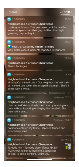
Figure 7: A screenshot that shows notifications received between May 18<sup>th</sup>-May 20<sup>th</sup>, 2021. Screenshot recorded May 20<sup>th</sup>, 2021.

Just over a year after the first public measures to curb the pandemic took effect in Texas, the state declared that all adults were now eligible to receive a vaccine. By early May of 2021, over a third of Travis Country residents were fully vaccinated and over one million doses of vaccines had been administered (Laskey). As I write this in May of 2021, the city in which I live seems to be entering yet another transitional state in the pandemic back into public life. Due to an order from the Governor's office following guidance from the Center for Disease Control, wearing a mask will no longer be required by state governmental agencies including my home university (Ragas). The presumption seems to be that the pandemic is reaching an endpoint, at least at a local level, and that the time is coming for the general population to readjust to public encounters. And yet, the notifications that are being communicated (Fig. 7) retain their dire messaging: natural disasters, "unexpected visitor[s,]" and the occasional loose pet. It is not entirely clear how daily life will proceed after this temporary stage of the pandemic, as members of my neighbourhood