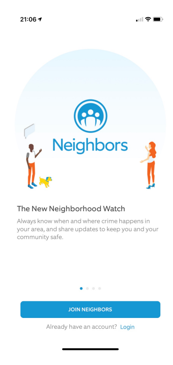
Figure 3: The screen shown before logging into Ring Neighbors on an iPhone demonstrates that Ring has not shied away from a comparison with the neighborhood watch. Screenshot recorded May 28, 2020.

hood watch acts to report people and behavior coded as other through posts and alerts that are then translated to timely notifications.