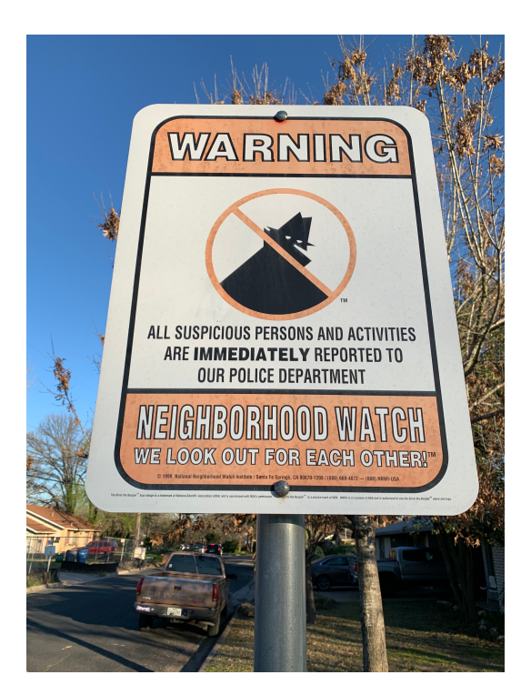
Figure 2: A Neighborhood Watch sign under two blocks from my apartment, faded from exposure to the sun over time.

predominantly white neighborhood" to the "well-intentioned, selfdescribed 'liberal' whites" who live there (Lowe et al. 37). While these neighbourhoods and the media they produce are not completely identical, the similarity of the setting as well as the researchers' concerns about a "recent increase in the use of digital surveillance strategies to monitor areas for suspicious activity" (Lowe et al. 37) when the article was published in 2016 raises a legitimate concern for my home.