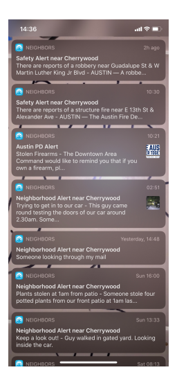
Figure 5: Screenshot recorded on October 1, 2019.

The notifiction from Neighbors continued later into that year (Fig. 5). I have included this screenshot because it shows a differentiation between three distinct types of notifications that emerged in the same series: Neighborhood Alerts, Safety Alerts, and Austin PD Alerts. While Neighborhood Alerts seem to come from posts made by community members, the Safety Alerts shown here as well as in the previous screenshot seem to be notifications of reported safety hazards such as fire or robbery. Meanwhile, the Austin PD Alert is a warning that people living in Austin should be registering their firearms in case they were later stolen. Though the sources of these alerts are all different and occurred over the course of four days, reading this collection of notifications continues to tell a notifiction that Cherrywood was supposedly an unsafe place and that inhabitants needed to be prepared. But again, the notifiction was easy to ignore with context.