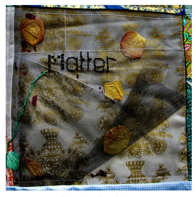
Figure 1: Matter. Corinna Peterken.