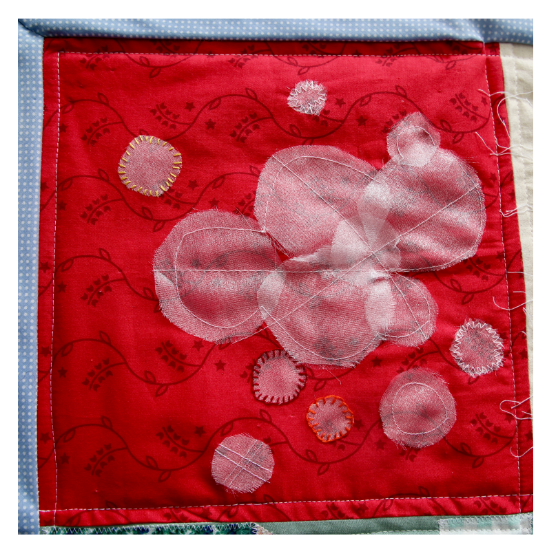
Figure 1: Pandemic bubbles. Corinna Peterken.