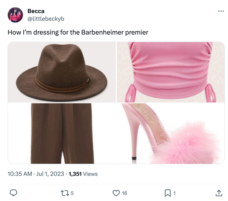
Figure 4: Screenshot of a tweet posted by Becca (@littlebeckyb).

mature demographic.” 4 An otherwise complimentary review stated, “I was excited, in spite of higher ideas about myself, to see Gerwig’s film.” 5 Many “Barbenheimer” enthusiasts recommended seeing Oppenheimer before Barbie , comparing it to having dessert after your meal.