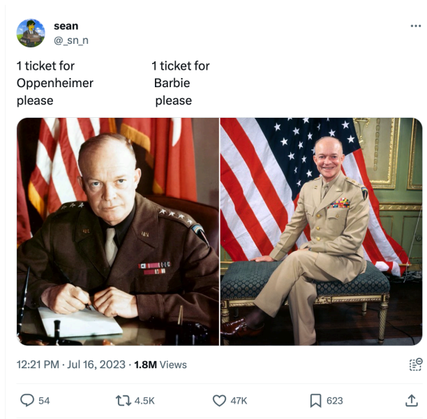
Figure 2: Screenshot of a tweet posted by Sean (@_sn_n).

recently Tenet (2020), are largely metaphysical and existential in nature. 3