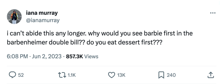
Figure 5: Screenshot of a tweet posted by Iana Murray (@ianamurray).

penheimer , as the titular character (characterized as a 20 th -century Prometheus) grapples with the politics, implications, and effects of creating the atomic bomb. The spectacular sound design of the movie engrosses the audience with a looming sense of dread and death.