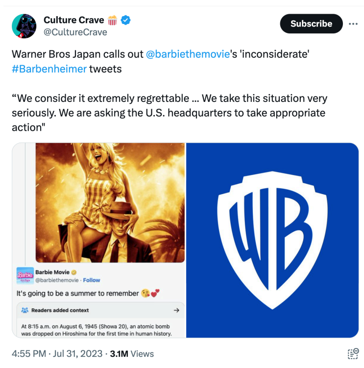
Figure 6: Screenshot of a tweet posted by Culture Crave (@culturecrave).

These critical conversations are sacrificed for more scenes of Jean Tatlock (Florence Pugh) languishing naked or Kitty Oppenheimer (Emily Blunt) being a drunken shrew, reducing women’s representation in the film to either the seductress or the nagging wife. The capitalist appropriation and historical choices of these films cause one to pause, and they merit a longer discussion than we can provide in this review. Are we playing back into the hands of Mattel’s consumerism? Are we participating in the regurgitation of a specific brand of history, one which perpetuates and incentivizes the white male gaze?