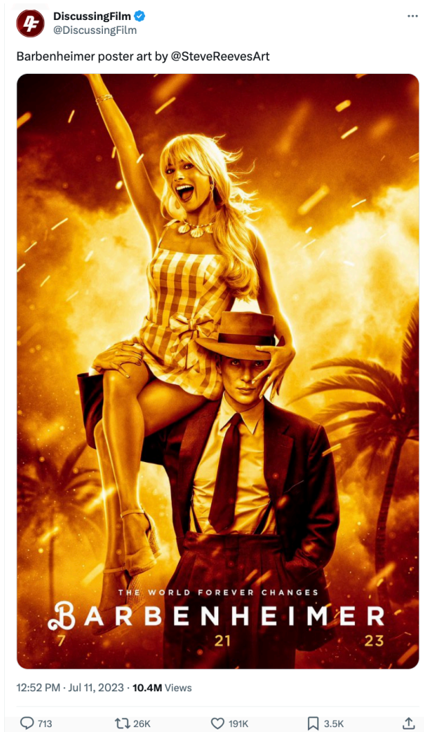
Figure 3: Screenshot of a tweet posted by Discussing Film (@DiscussingFilm). Poster art by Steve Reeves (formerly @SteveReevesArt).